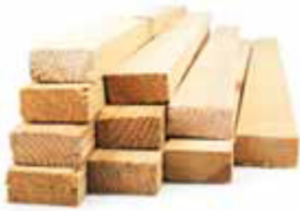
Planed wooden planks (for use with crates) Various lengths: Approx 1m/1.5m long x 200mm wide x 15/20mm.