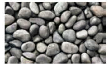
River pebbles Diameters range from 100 -200mm.