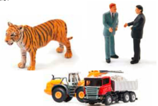
Miniworld figures, animals and vehicles