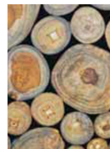
Pennies/slices of timber 200-300mm diameter, 30- 40mm deep