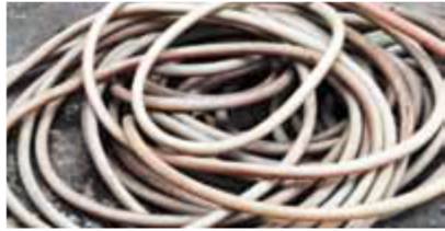
Garden Hose (can have holes)