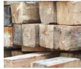
Timber sleeper offcuts Various sizes and lengths. Average size 250mm x125mm x length.