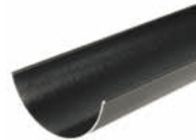
Guttering and connections