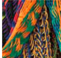
Strips of fabric For fence weaving. Approx 8 cm wide, as long as possible.