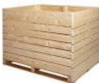
Tattie boxes for storage x 2 (with part of the front removed)

Please contact us if you would like further details or have any suggestions.