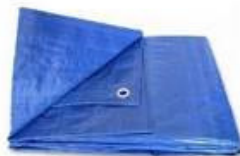
Tarpaulins (especially with eyelets)