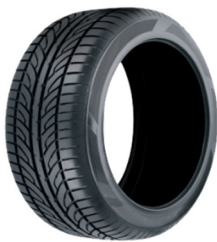
Car tyres, steering wheels and car seats