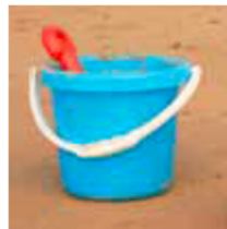
Sand equipment: Large plastic spades, plastic trowels, rakes for combing, buckets, containers, and moulds.